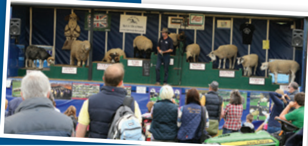
Great Shopping – Eventing – Showjumping – Inter Hunt Relay – Kauto Star Masterclass and much much more.