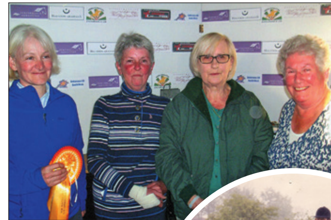
▲ The Golden Oldies

CONTACT DETAILS ▶▶▶ Please call 0750 669 7588 or email: lizausten@yahoo.co.uk