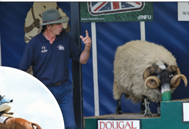
According to Horse & Hound, Barbury is the third most popular Great British Day Out.