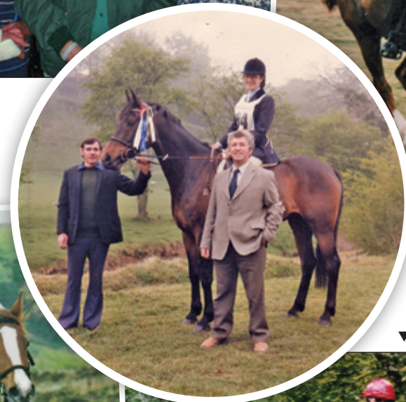
▲ Autumn Charisma plumpton