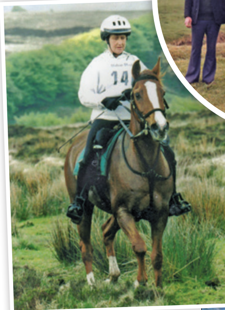
▼ Autumn Charisma Veteran ride